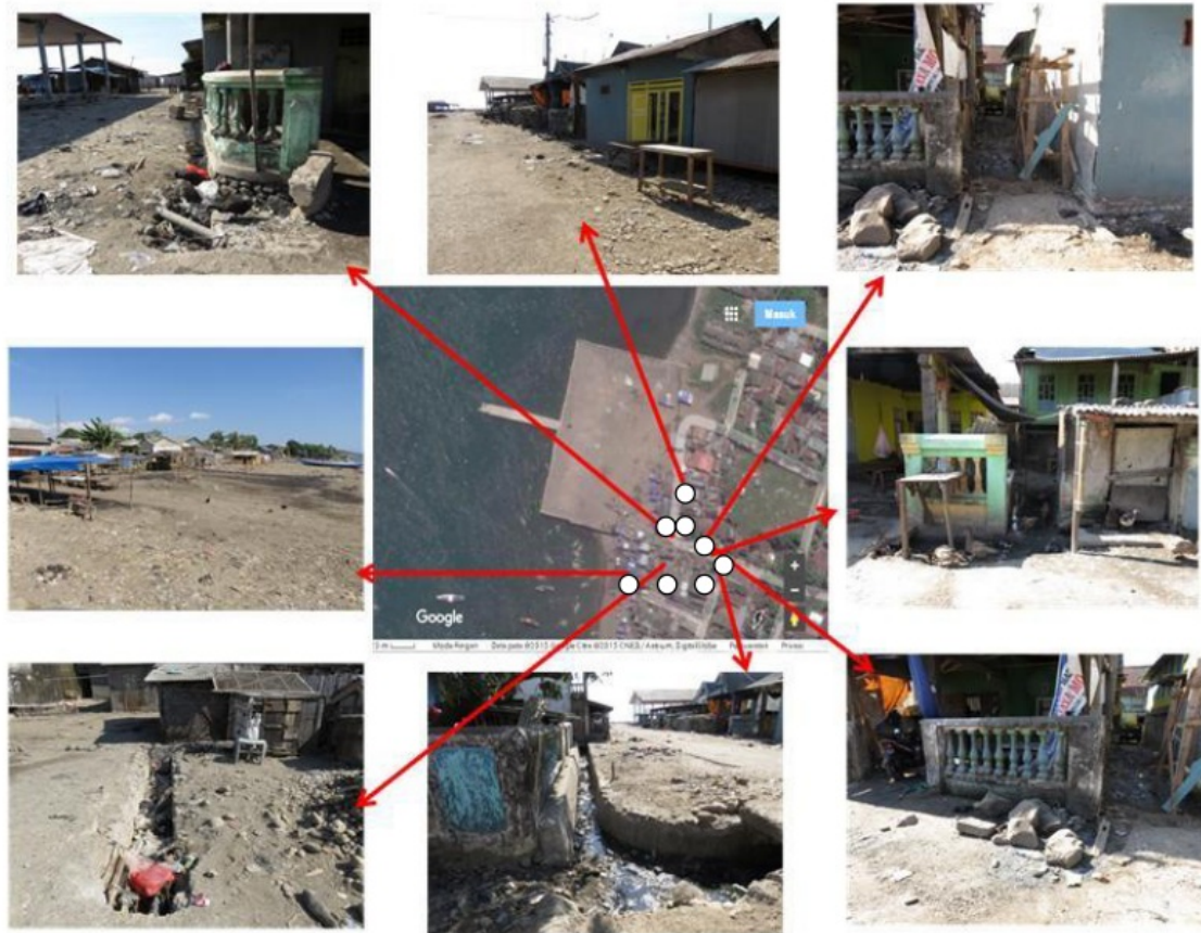
Fig. 3. Sanitation System in The Environment Beba TPI

Based on the results of field observations of the environmental sanitation condition in TPI beba, as follows :