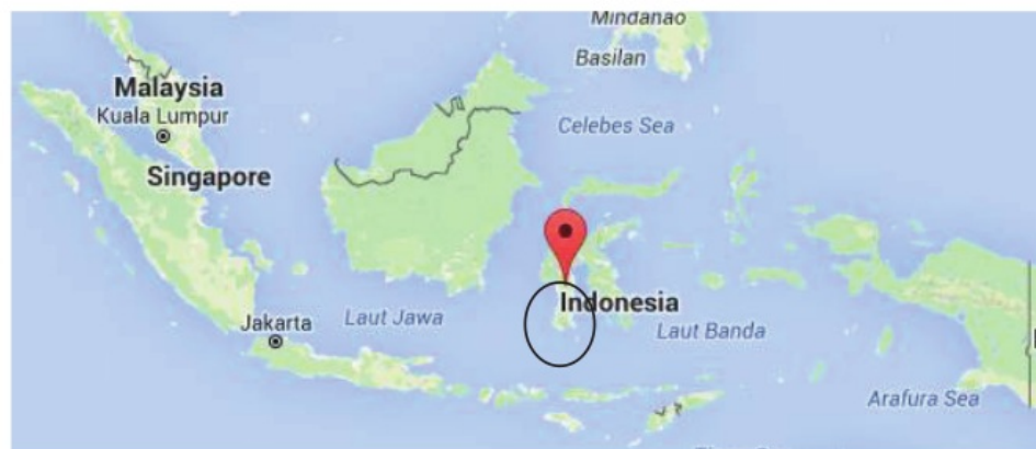
Map of Indonesia