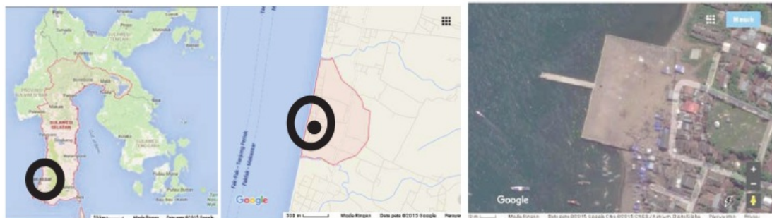
South Sulawesi, Tamasaju Distrik, and Beba TPI Fig. 1. Location of Beba TPI. (source: google)