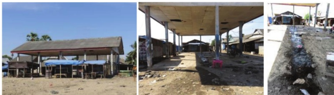
Fig. 2. Beba TPI Building

The condition of the buildings are open without walls. Measures about 8 x 12 m. There is no drainage cannel and water tanks for washing fish, other than that there is no garbage dump in the TPI area. The lower floor of the central part of TPI building, making dirty water always inundated in that area.